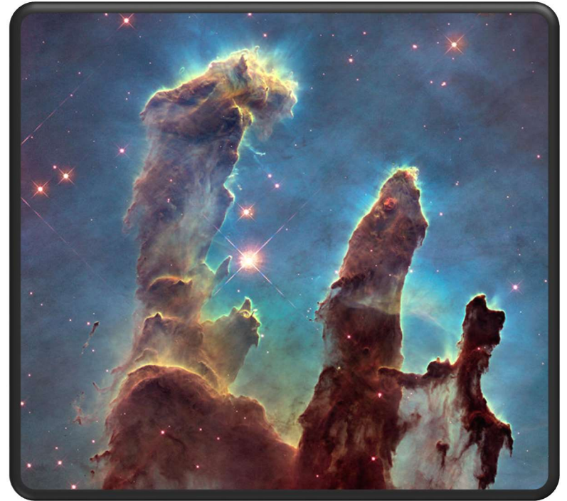
"Pillars of Creation"